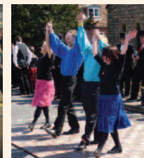
Cricket on the Hearth